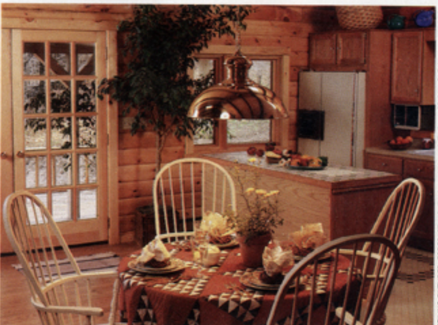
The clean lines of a Shaker desk, above top, come alive in blue. Thanks to an open plan, the dining area, above bottom, is only steps away from the kitchen. A Welsh hutch, right, can double as a serving area.

CEILING FIXTURES: FORECAST LIGHTING CERAMIC TILE: AMERICAN OLEAN ALL DOORS: MORGAN PRODUCTS ALL BRASS LOOKS: SCHLAUSE