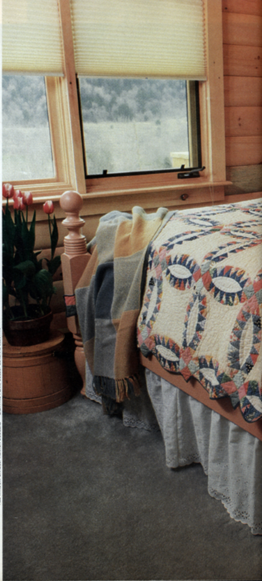
ALL WINDOW SHADES: HUNTER DOUGLAS LIGHTING PLAN, BULBS: GENERAL ELECTRIC