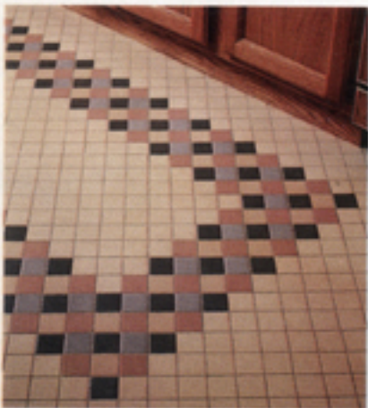
A rug pattern inspired the ceramic tile floor, above. The same design is used on the counter.

Setting off the kitchen area is a ceramic tile floor custom-designed by Pam to imitate an accent rug. The island's tile countertop, which echoes the design, incorporates dusty shades that help link this area to the living room.