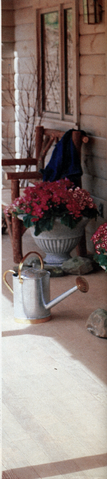
RUSTIC FURNITURE: GRANT'S

A sun porch, shaded by the eaves, provides a comfortable spot for taking in the view. Sturdy log furniture, reminiscent of grand turn-of-the-century estates in the Adirondacks, completes the scene.